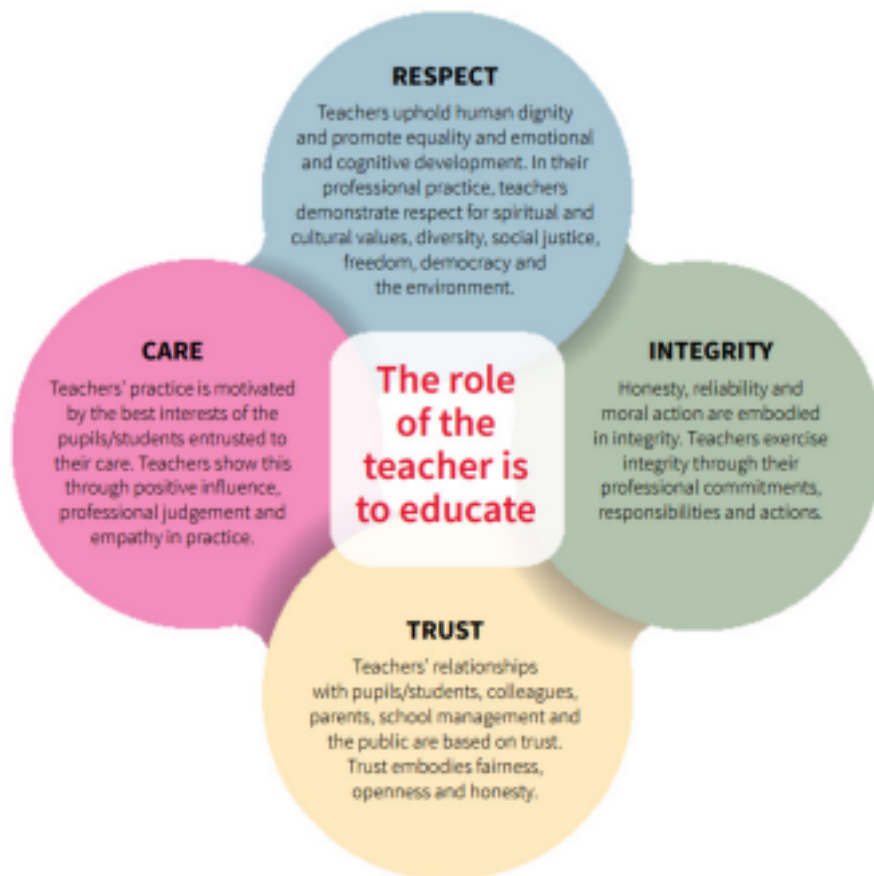
Figure 1: Standards of teaching, knowledge, skills, competence and conduct