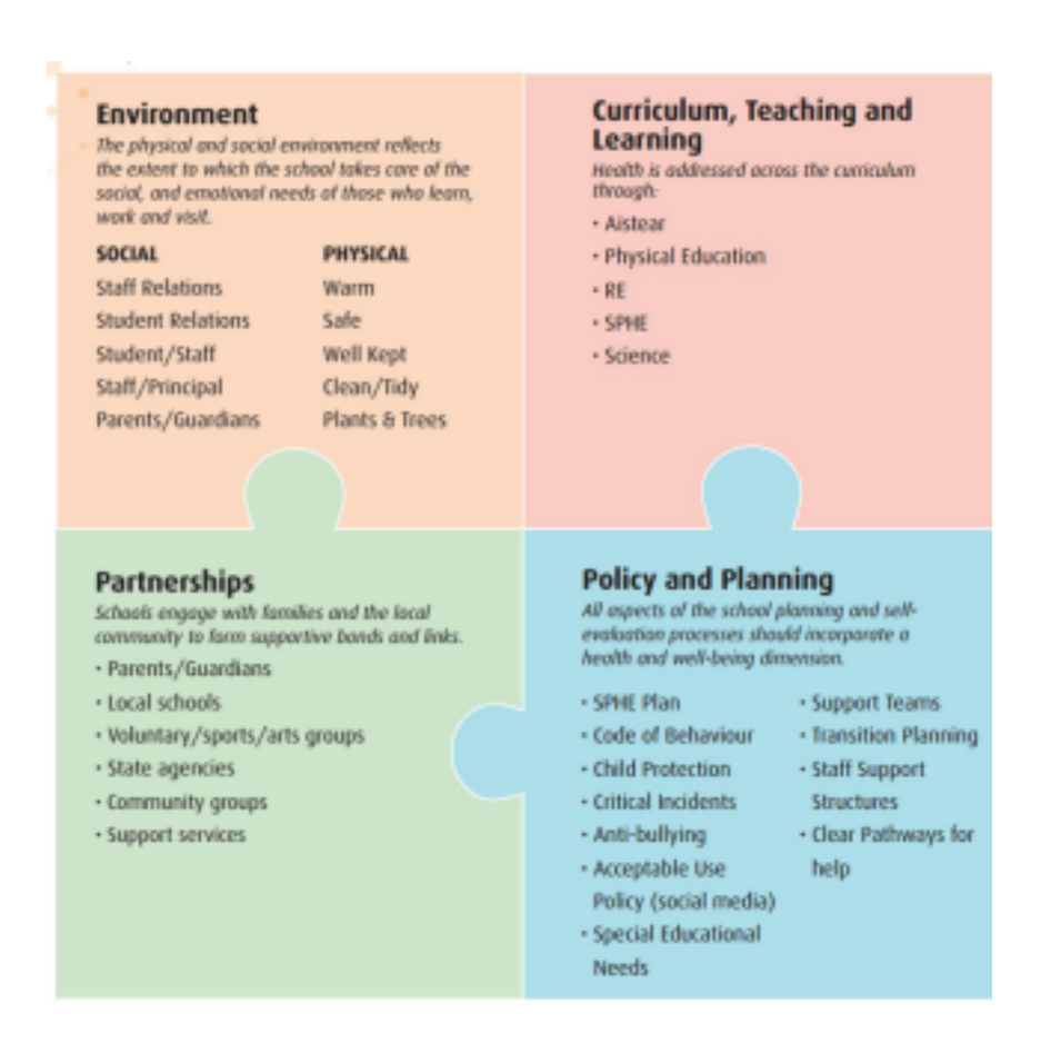
Figure 2: The Health Promoting School: Four Key Areas of Action

Adult bullying and harassment in the workplace are phenomena which this school will seek to prevent and will not tolerate. All employees have the right to be treated with dignity and respect. Management is committed to intervening in an appropriate manner - utilising one of the accepted Management/INTO procedures - to investigate and deal with allegations of bullying or harassment. The provisions of Circular 40/97 on Assaults on Staff in Primary Schools will be utilised as appropriate.